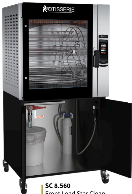
SC 8.560 Front Load Star Clean