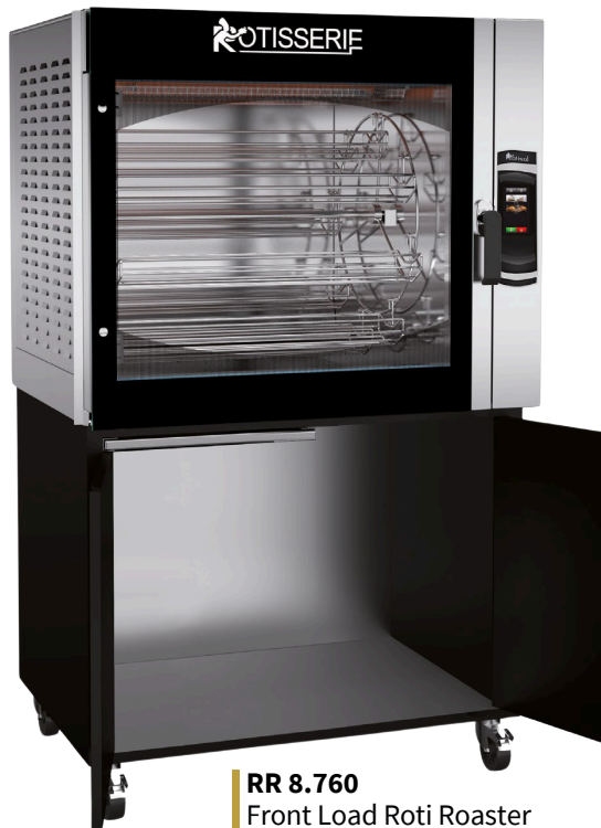
RR 8.760 Front Load Roti Roaster